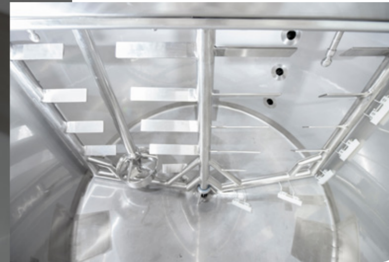
Jetstream mixer with anchor agitator