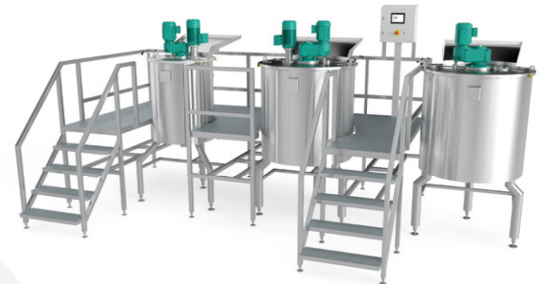
Sauce production unit with various combi-mixing options

For production of creamy sauces or silky smooth creams, Gpi has the right solution!