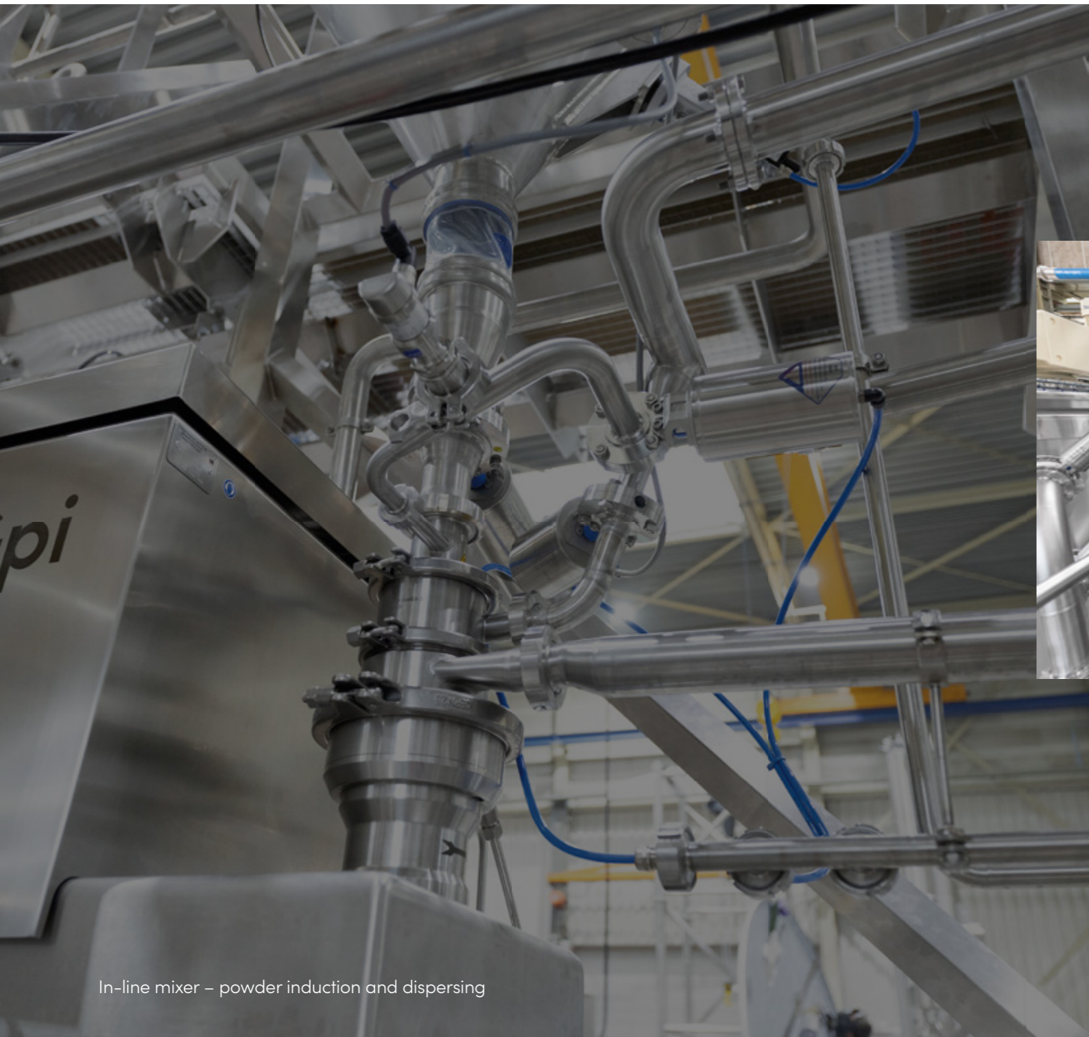
In-line mixer – powder induction and dispersing