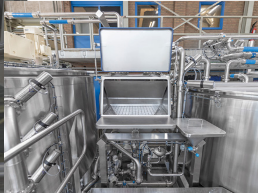
Bag emptying unit